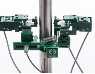
Model 3550 axial/torsional extensometer with a 25 mm gauge length, ±10% axial measuring range, and ±2° torsional shear strain angle measuring range (this corresponds to a 4° angle of twist on a 12.5 mm diameter specimen)

The Model 3550 extensioneter is most often used on round specimens tested in bi-axial test machines capable of simultaneous axial and torsional loading. The extensioneter is often customized for particular applications. All units are capable of bi-directional displacement, so they may be used for cyclic testing under fully reversed loading conditions. The standard sized model is self-supporting on the specimen, and works on specimens from 9.5 to 25.4 mm (0.375 to 1.000 inches). The conical point contacts included with