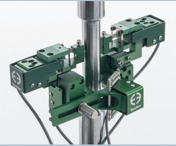
Model 3550 extensometer (angled view) 3550-025M-010-002-ST